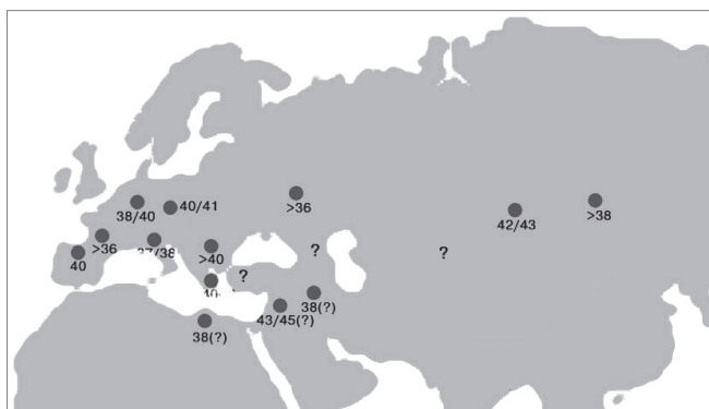
Figure 1: The distribution of the earliest Upper Paleolithic industries and their minimum ages.